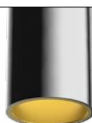
decorative gold lamp ring for TULA MICRO